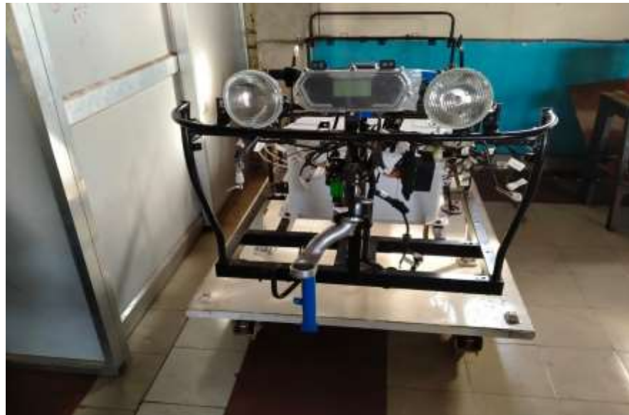
Mahindra & Mahindra E- Vehicle lab at ITI, Rourkela