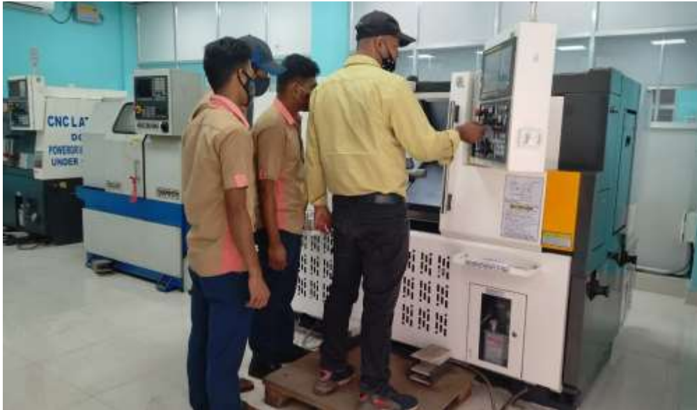
ITI, Talcher:- State Plan resource Rs153.00lakhs