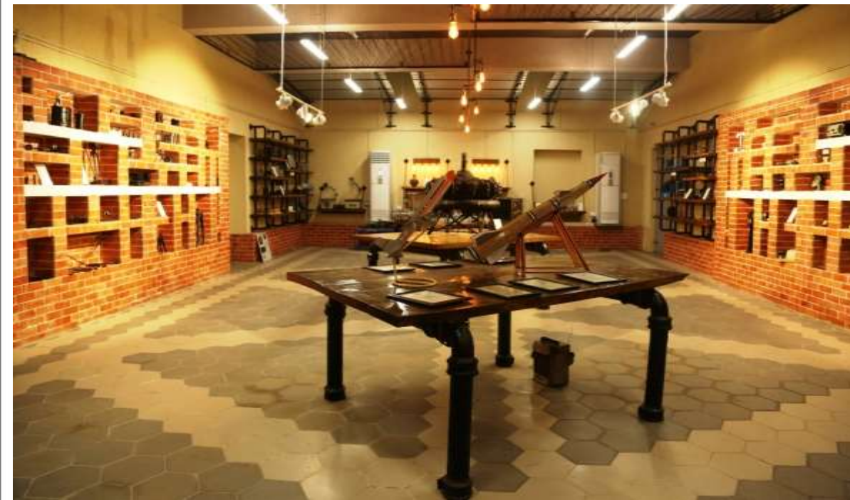
Skill Museums at ITI, Cuttack