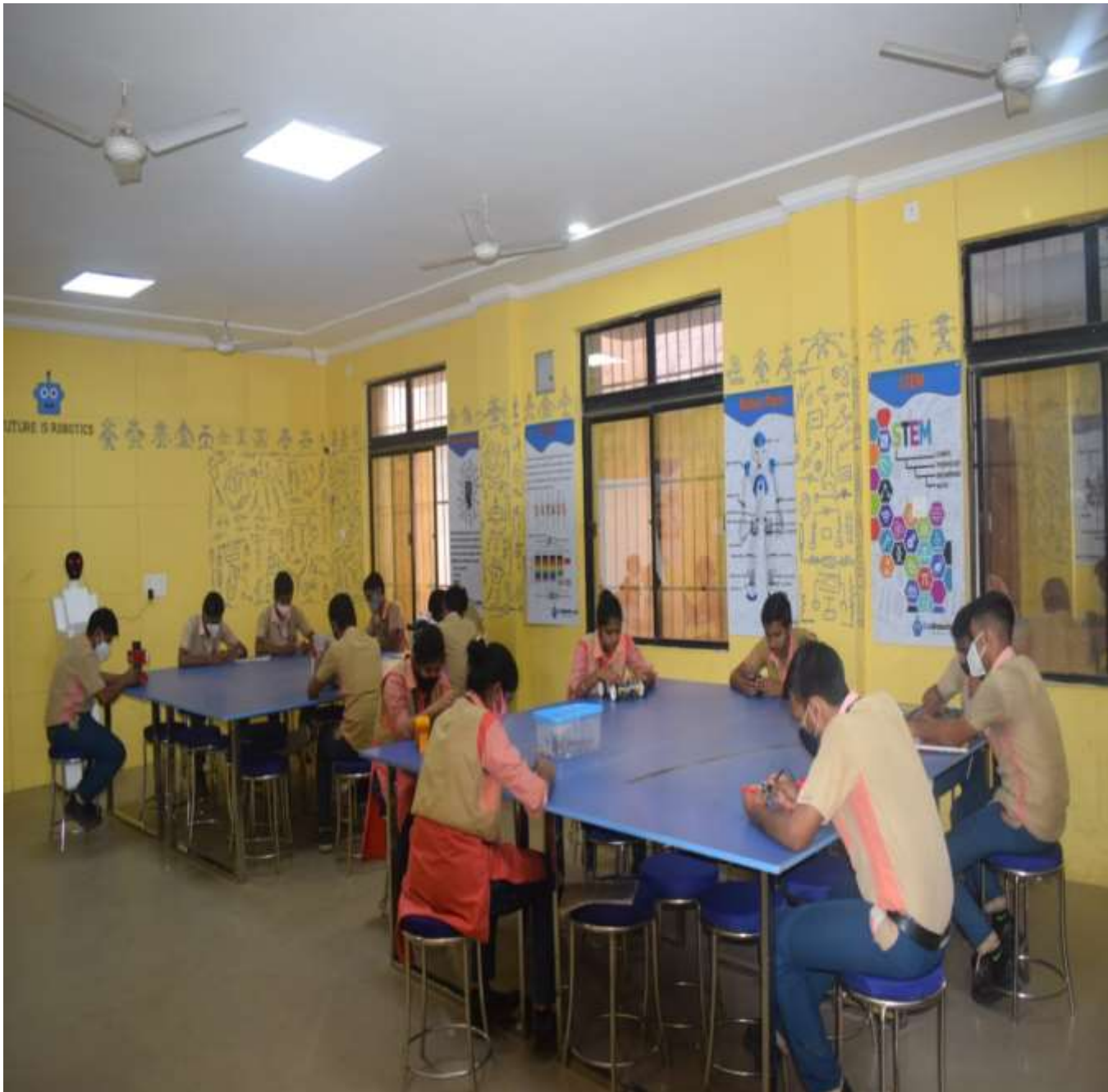
Robotics Lab at 10 ITIs and 10 Polytechnics