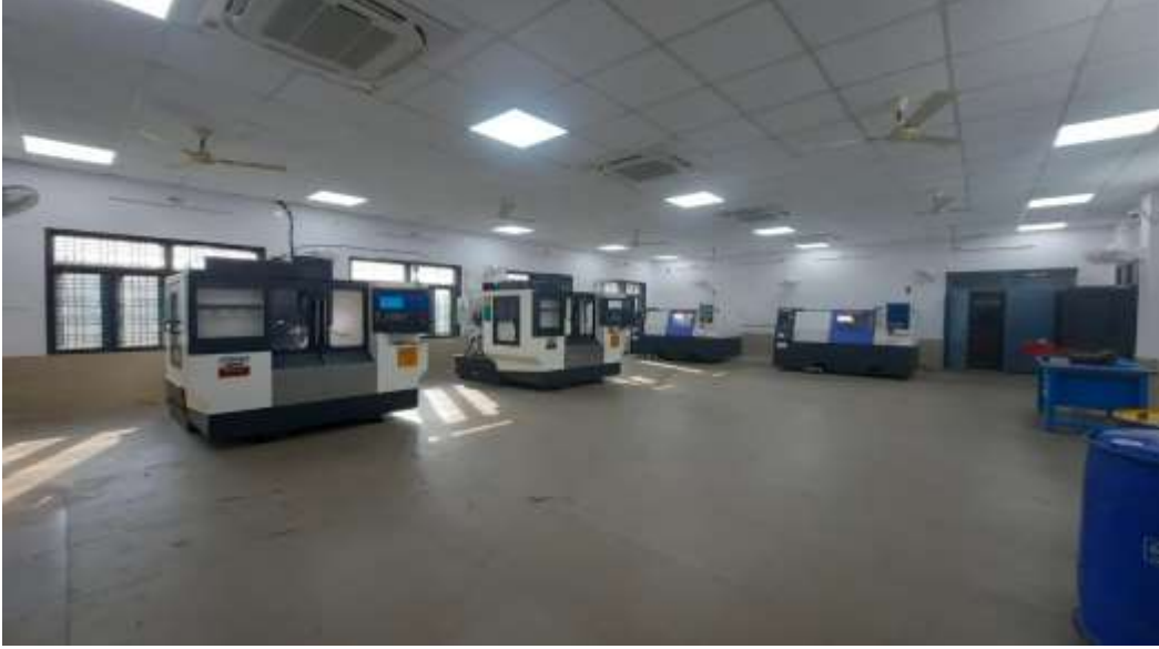
ITI, Jharsuguda:- DMF Jharsuguda resource Rs244.50lakhs