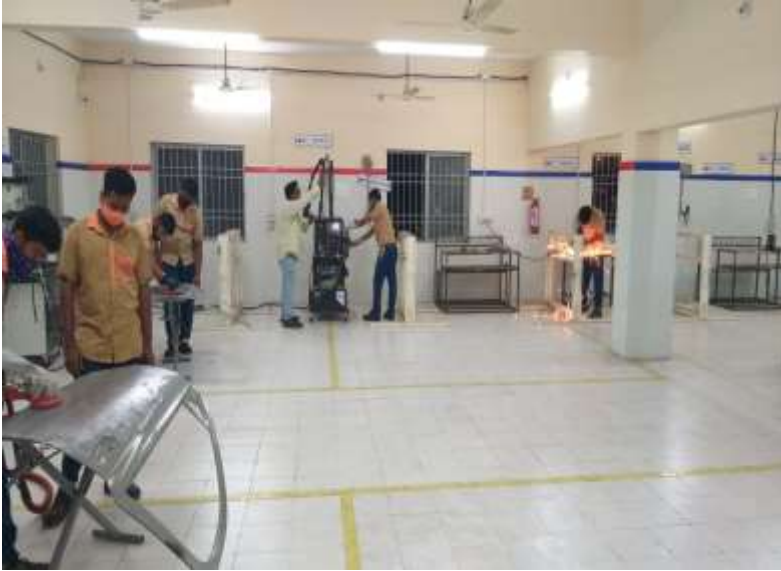
Auto Body Welding Training