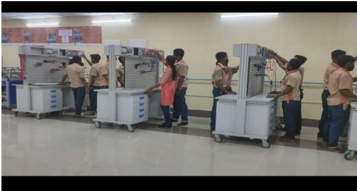
Mechatronics Lab at ITI, Cuttack