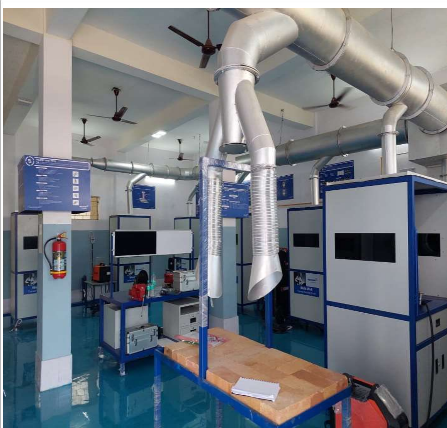
Centre of Excellence in Welding with Thermal Cutting commissioned at Government ITI, Jajpur