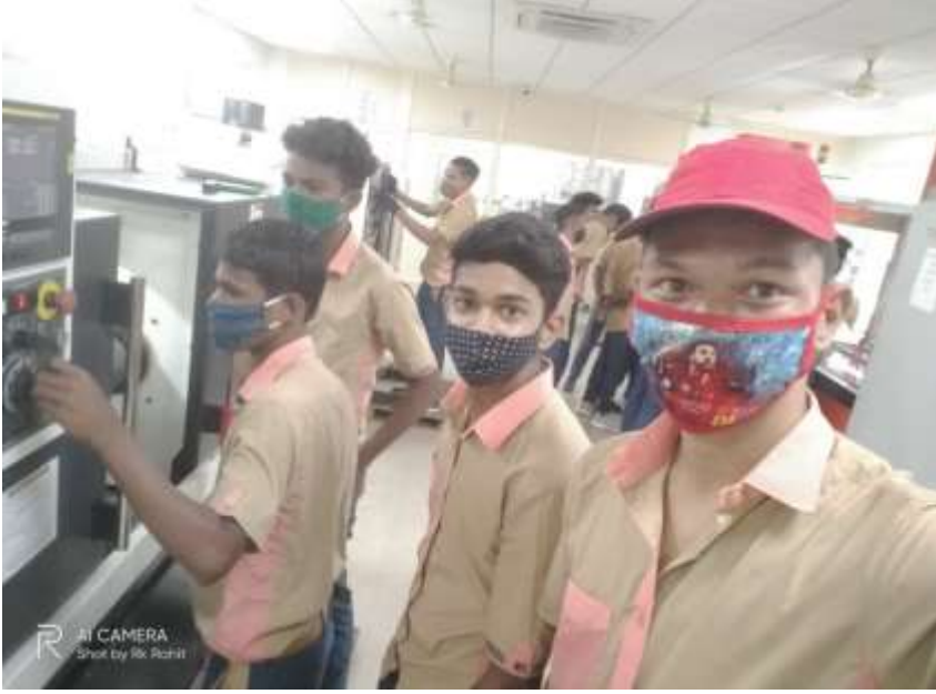
ITI, Hirakud:- State Plan resource Rs197.00lakhs