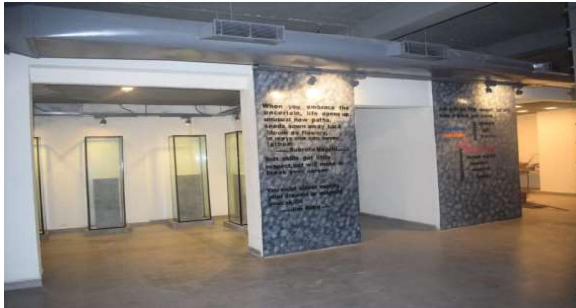
Skill Museums at ITI, Bhubaneswar