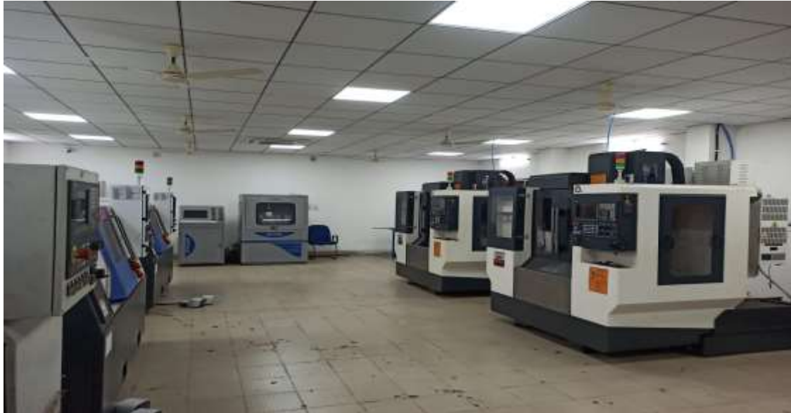
ITI, Barbil:- DMF Keonjhar resource Rs247.60lakhs