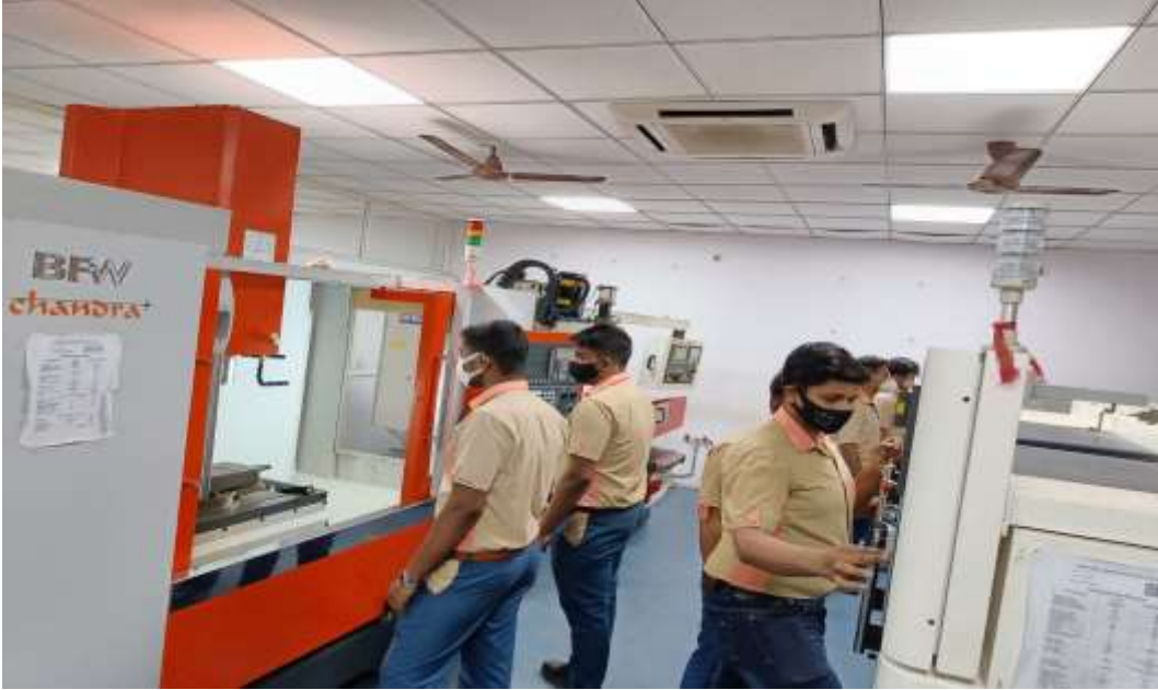
ITI, Cuttack:- State Plan resource Rs142.00lakhs