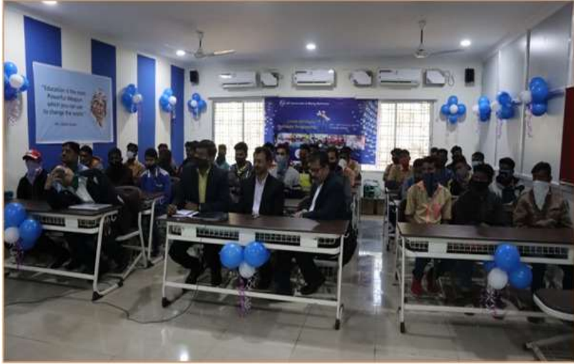
L&T CMM Training at ITI, Barbil