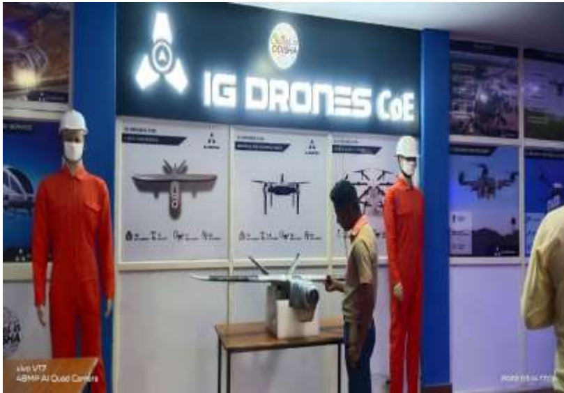
Drone Technician Training