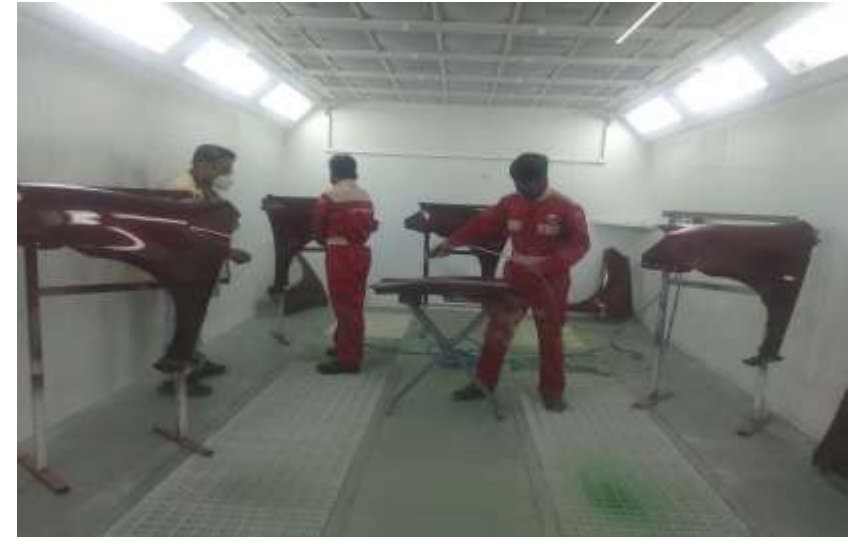
Auto Body Paint Training