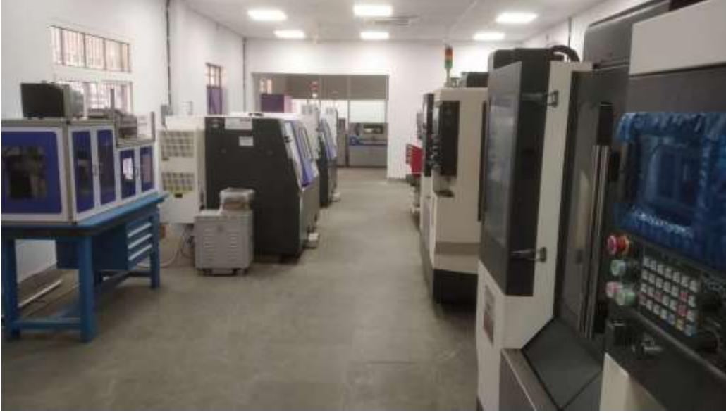
ITI, Rourkela :- DMF Sundargarh resource Rs247.80lakhs