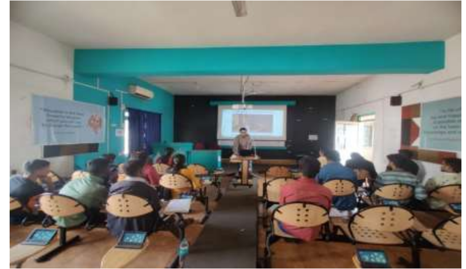
Sandvik Mining Training at ITI, Barbil