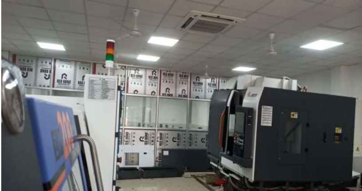
ITI, Malkangiri:- State Plan resource Rs187.00