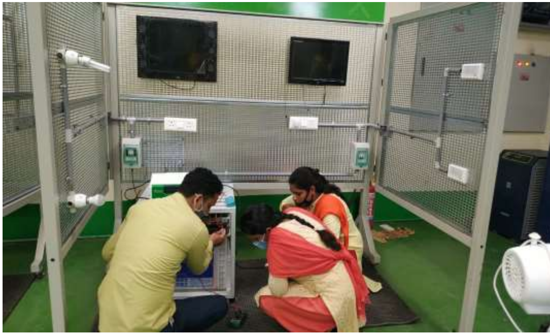
Solar Technician Lab at ITI, Cuttack