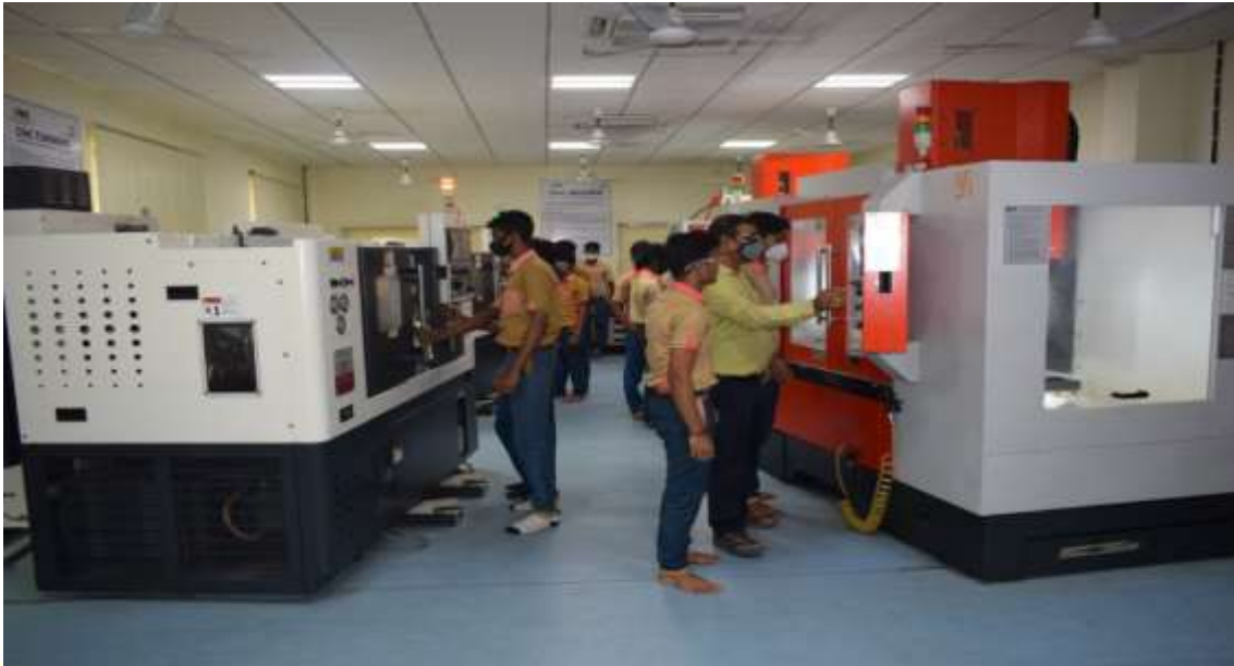
ITI, Berhampur:- State Plan resource Rs210.00lakhs